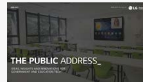
ISSUE 03 JUNE 2021