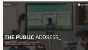
ISSUE 02 MARCH 2021