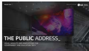
ISSUE 05 JANUARY 2022