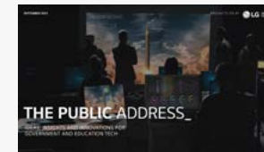
ISSUE 04 SEPTEMBER 2021