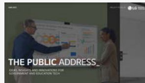
ISSUE 06 JUNE 2022