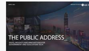
ISSUE 08 MARCH 2023