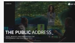
ISSUE 07 OCTOBER 2022