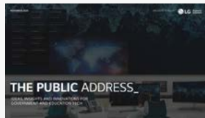
ISSUE 01 NOVEMBER 2020